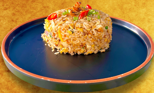
W33 家乡炒饭 KAMPUNG FRIED RICE Rm 15.90