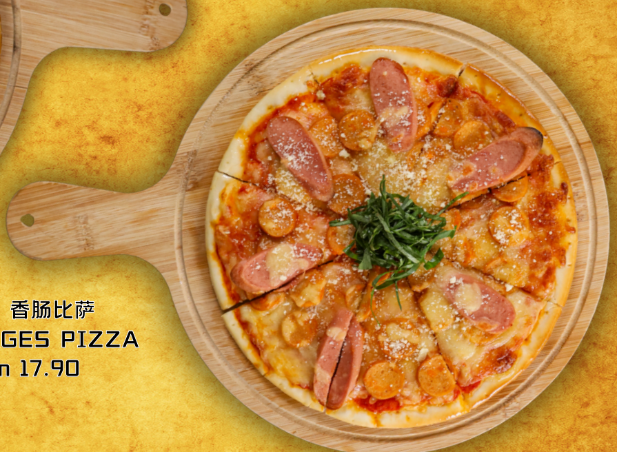
W9 香肠比萨 SAUSAGES PIZZA Rm 17.90