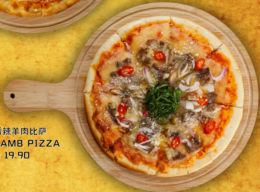
W7 香辣羊肉比萨 SPICY LAMB PIZZA Rm 19.90