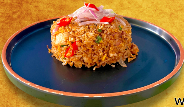
W35 东炎炒饭 TOMYAM FRIED RICE Rm 15.90