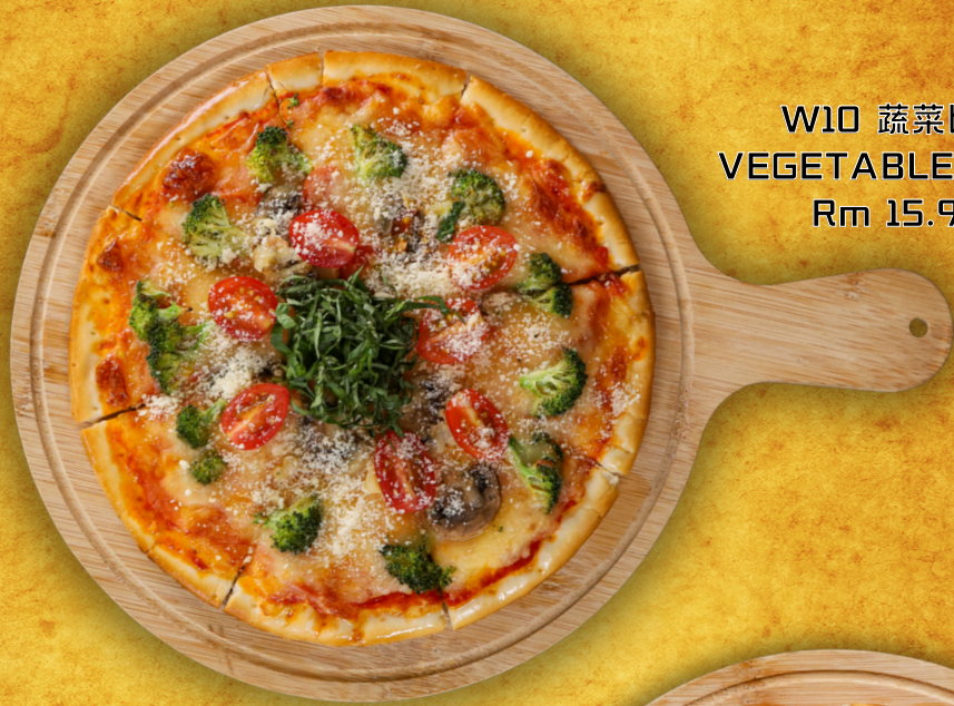
W10 蔬菜比萨 VEGETABLE PIZZA Rm 15.90