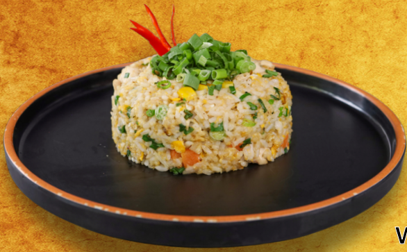
W11 西式炒饭 WESTERN FRIED RICE Rm 13.90