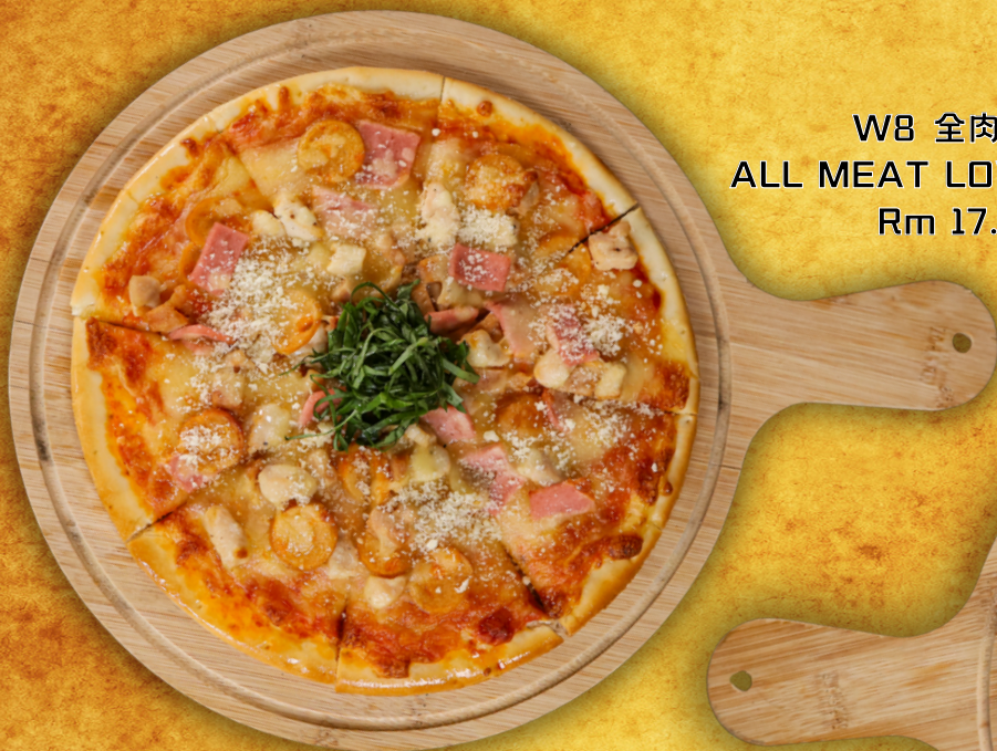
W8 全肉比萨 ALL MEAT LOVER PIZZA Rm 17.90