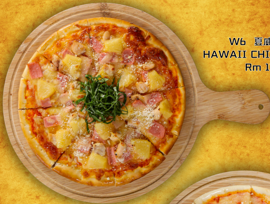
W6 夏威夷鸡肉比萨 HAWAII CHICKEN PIZZA Rm 17.90