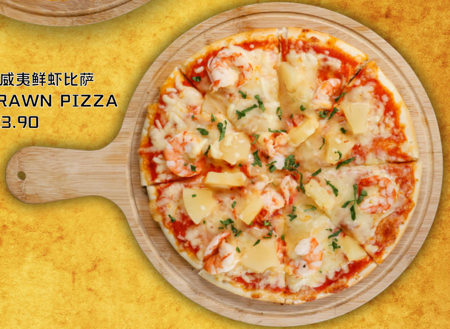
W30 夏威夷鲜虾比萨 HAWAII PRAWN PIZZA Rm 23.90